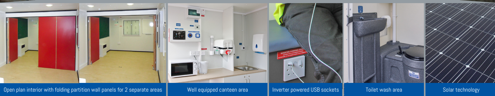
Open plan interior with folding partition wall panels for 2 separate areas

ANTI-VANDAL, ROBUST AND EASY-TO-USE STATIC WELFARE ACCOMMODATION UNIT.